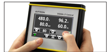
Optional SIGMA LT Hand-Held Controller.

SIGMA software can be updated free of charge through the Avtron website at the following link .